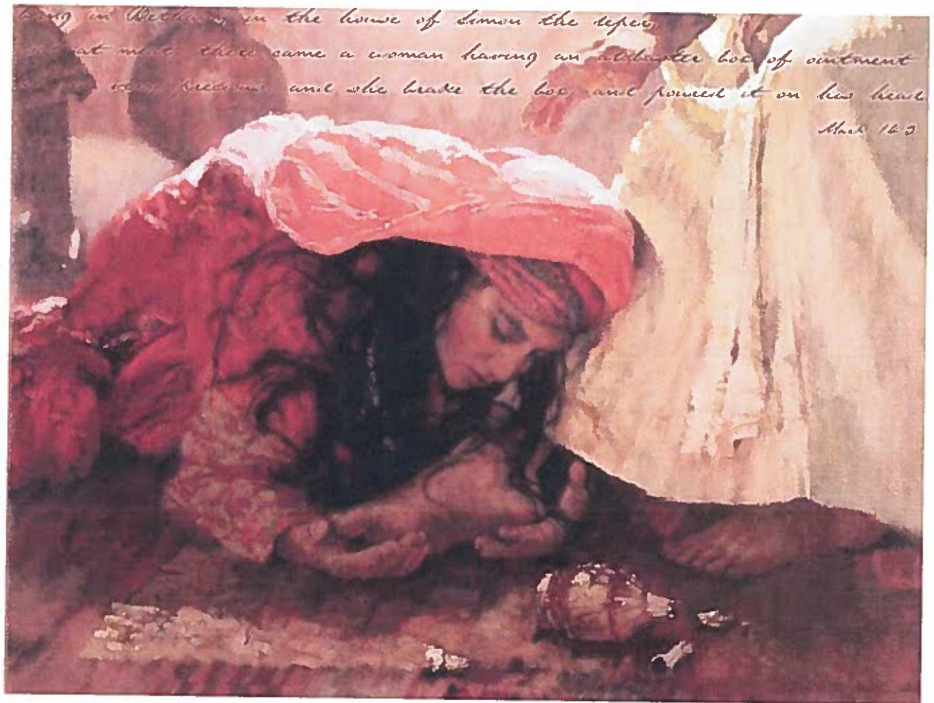
This intimate painting was on multiple sites but I could not find the name of the original painter.

Here [in Bethany], a dinner was given in Jesus' honor. Martha served, while Lazarus was among those reclining at the table with him. Then Mary took about a pint of pure nard, an expensive perfume; she poured it on Jesus' feet and wiped his feet with her hair. And the house was filled with the fragrance of the perfume.