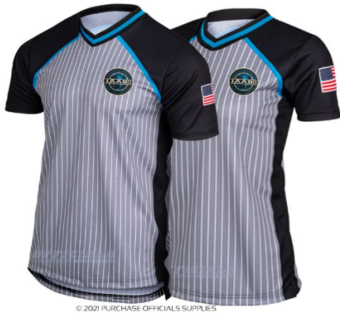
Optional – Black sleeve gray with blue trim raglan style shirt