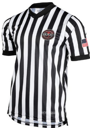
Optional – Black & White Stripe