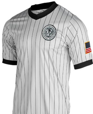
No Longer Approved For Use