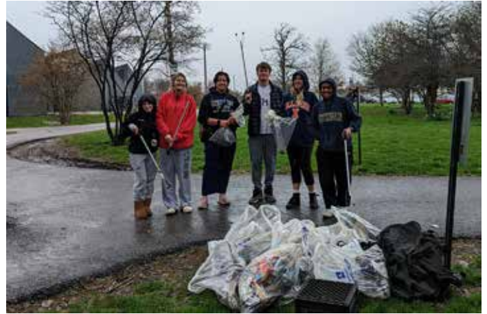
The next generation of river advocates are getting involved cleaning up the watershed.

Chicago River Schools Network (CRSN) educational programming was employed by 173 teachers during the 2021-22 school year. Friends took 1,374 students on experiential learning field trips to the river and had a total impact of 12,045 students taught.