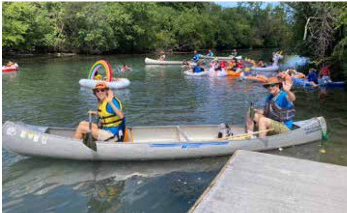
Fun in the river at the first ever Chicago Float Party.

Elected officials, families, and friends came together at the inaugural Summer Float Party in August 2021 to build awareness for water quality standards that protect much of the river system for swimming and to celebrate the river's improved health. Participants set off from the Damrich Rowing Center in Skokie and floated along the North Shore Channel. Friends has since made this event an annual one, with more participants and a new Chicago location.