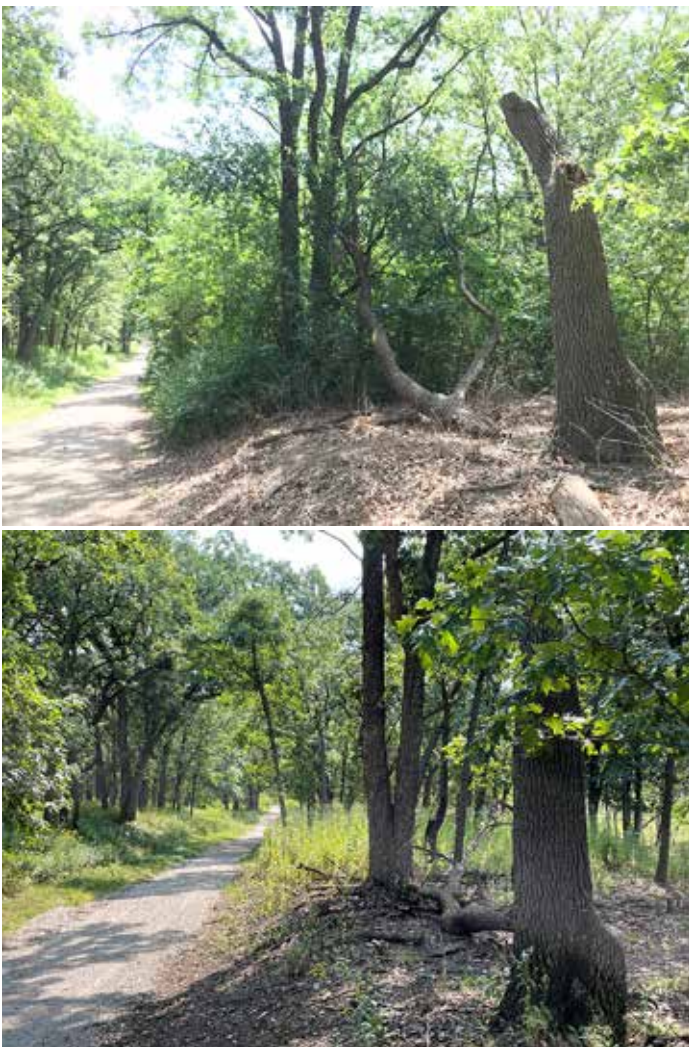
Before (on top) and after photos of forest preserve restoration in the Palos region.

On-the-ground projects directly improved the health of the river and its adjacent lands. Friends restored 77 acres of river-edge Forest Preserves of Cook County (FPCC) sites in the past year, including 49 targeting turtle habitat restoration. In addition, Friends conducted resprout follow up maintenance treatments on work in the Palos region, completing the restoration of nearly 214 additional acres since 2020 in partnership with the FPCC. After an unsuccessful nesting season in 2021 due to storm destruction, two chicks fledged out of the osprey nesting pole we installed at Beaubien Woods in 2022. Volunteer monitors also saw osprey nesting activity at the Erickson Woods pole next to Skokie Lagoons for the first time.