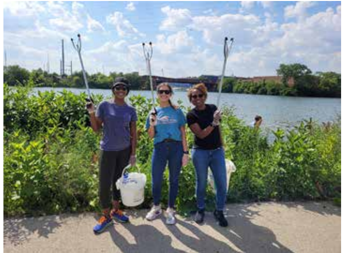
A volunteer litter pickup day along the North Branch.