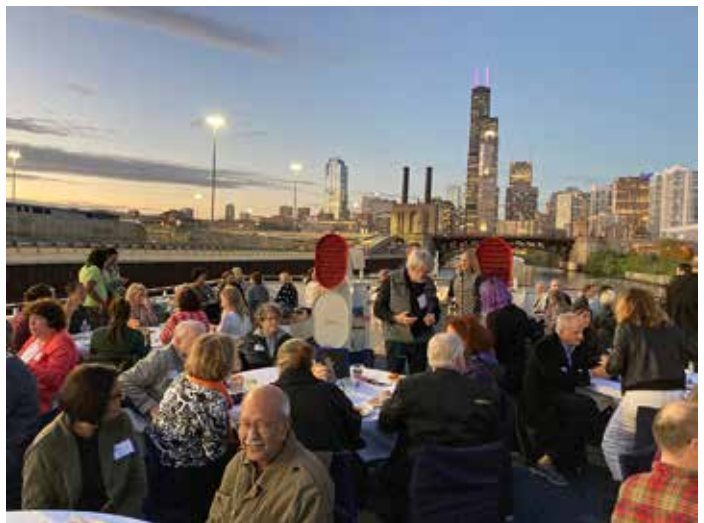
Autumn Cruise guests enjoy an incomparable view of Chicago from the river at dusk.

A beautiful and festive fall evening on the Chicago River in October 2021 was enjoyed by more than 175 revelers who departed from the Wendella boat dock in front of the iconic Wrigley Building for the eighth annual river cruise benefiting the education and public outreach programs of the McCormick Bridgehouse & Chicago River Museum. Guests enjoyed delicious food and drink, and were serenaded by a viola and violin duo from the Fifth House Ensemble as they traveled down the South Branch of the Chicago River