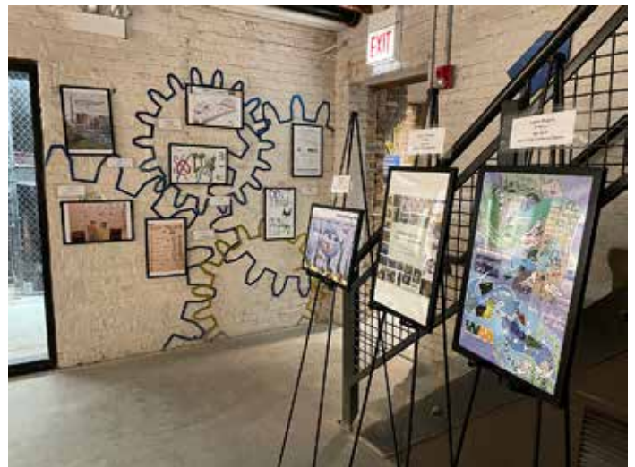
Student artwork displayed at the Bridgehouse Museum demonstrating the importance of a litter-free river.

After a hiatus in 2021, the CRSN's Chicago River Student Congress returned as an outdoor event in 2022, to safely engage over 120 students in a celebration of environmental education, public land restoration, and water quality. The CRSN held a poster contest aligned with Chicago River Day, highlighting students' artistic talents and calls to action for a litter-free river. Winning posters were displayed at the Bridgehouse Museum during the entire 2022 season.