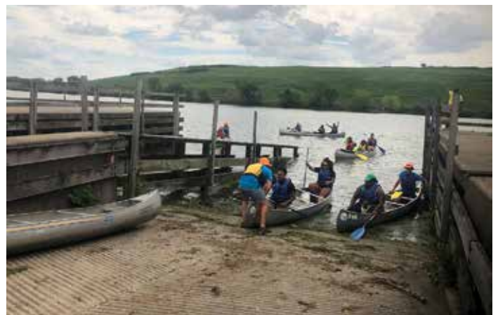
An African American Heritage Water Trail tour kicks off at Beaubien Woods.

Friends reinstated popular paddling events including birding tours and stops at river-edge breweries. To connect people to their local waterways, Friends supported free community paddles in the Little Calumet River for local residents, a rare opportunity for residents to get to know the waterway as a beginner, learn to paddle, and enjoy the mental and physical benefits paddling provides. Friends partnered with Openlands and the Forest Preserves of Cook County to train Friends of the Forest Preserves' interns to be able to present information on the African American Heritage Water Trail, safely and effectively from the water.