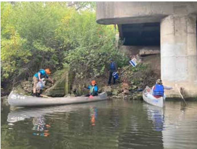
Removing litter by the Dammrich Rowing Center in Evanston, IL.

As part of the Litter Free Chicago-Calumet River program, Friends held 29 river-edge cleanups, doubled the number of Canoe and Clean paddles to twice monthly, and in a new initiative, established six Litter Free Supply Stations housed by partner organizations which enable people to conduct work days on their own.