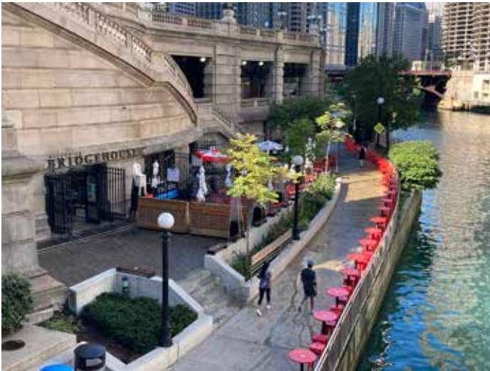
The beautiful downtown Chicago Riverwalk, home to the Bridgehouse Museum.

Chicago River Schools Network (CRSN) educational programming was employed by 173 teachers during the 2021-22 school year. Friends took 1,374 students on experiential learning field trips to the river and had a total impact of 12,045 students taught.