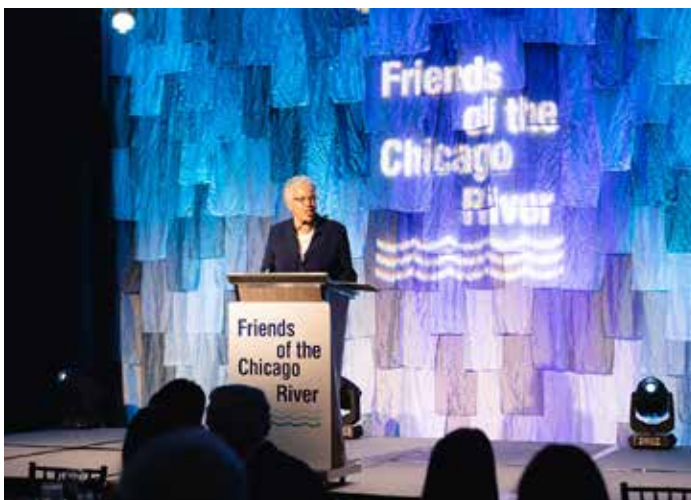
Toni Preckwinkle addresses a packed crowd at the Big Fish Ball.