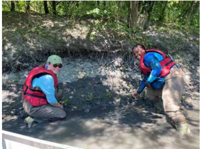
Volunteers install native plants along the Little Calumet.

Friends increased the number of plugs of native water willow and lizard's tail plants in the river to over 10,000 since 2017, including at two first-time locations: 984 plants in the Little Calumet River, and 266 at the Lathrop Homes public housing community. These important species create fish habitat, spread naturally through rhizomes in their root systems, and are maintenance-free.