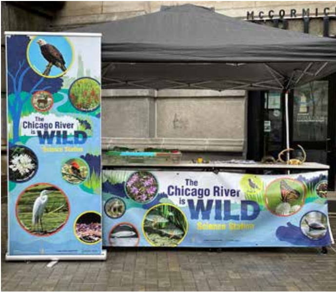
This vibrant educational cart attracts curious visitors to the Bridgehouse Museum.

A grant from the Institute of Museum and Library Studies allowed Friends to debut a new educational cart in front of the McCormick Bridgehouse & Chicago River Museum in order to engage new audiences in 2022. In addition to live displays of water quality testing and how water moves through a watershed, the cart's vibrant signage attracts people to the museum's doors.