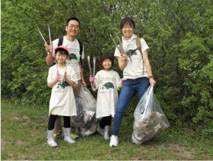
Family fun during Chicago River Day by the North Shore Channel.

During the 30th annual Chicago River Day, Friends welcomed over 2,000 volunteers to participate at a record 77 locations across the watershed. Increased partnerships with traditional and digital media led to the event receiving 486 million media impressions, spreading the importance of a litter free river to a broad audience.