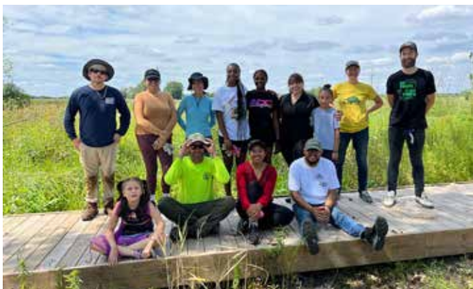
Community members after a planting day with Friends' staff at Indian Ridge Marsh – South.

Friends and the Greater Chicago Watershed Alliance began a catalytic pilot project at Indian Ridge Marsh – South, a Chicago Park District site in Chicago's South Deering community, to offset centuries of environmental injustice through pollution, as well as altered hydrology, climate change, and the introduction of invasive species. In addition to facilitating $100,000 of restoration, Friends also engaged with the Southeast Youth Alliance (SYA) to activate the space and involve local residents in the restoration process. The Alliance is a grassroots community organization whose mission is to amplify opportunities for local youth on Chicago's Southeast Side and develop the next generation of community leaders.