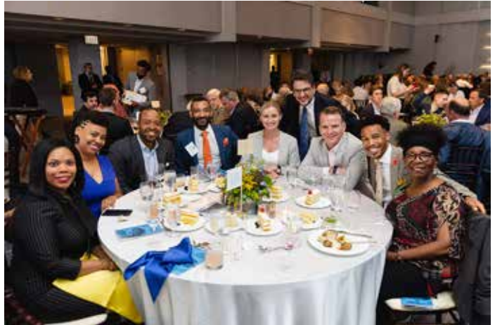
The Big Fish Ball is one of Friends’ annual signature events.