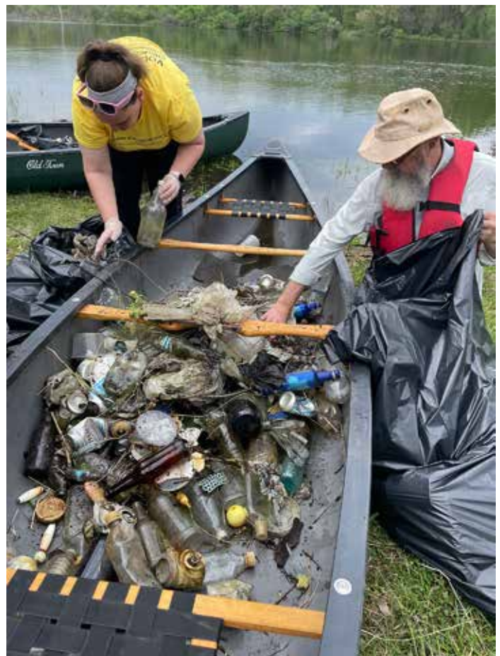
Friends' volunteers remove tons of plastics and other trash from the river each year.

to provide technical assistance and guidance on river edge site planning and urban design. Friends' staff have advocated for upholding the core components of the Chicago River Design Guidelines, emphatically stating that any river-edge casinos and music venues must embrace the river as a natural resource for people and wildlife, rather than a water feature to be exploited for entertainment. Friends also publicly expressed disappointment in the single-use plastics ordinance passed by the Chicago City Council in September 2021 because it fails to go far enough to curb plastic pollution and eliminate polystyrene used in foam takeout containers and drinking cups (see plastics and other pollution removed from the river). Friends continues to advocate at the state level for stronger legislation.