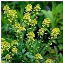
Common Winter Cress