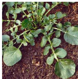
Early Winter Cress