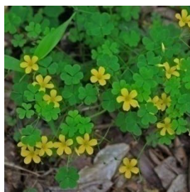
Creeping Wood Sorrel