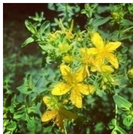
Common St. Johnwort