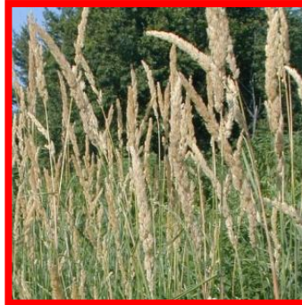
Reed Canary Grass