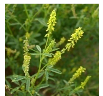
Yellow Sweet Clover