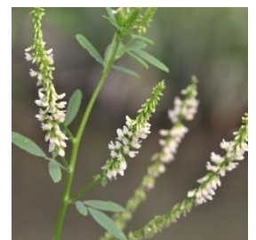
White Sweet Clover