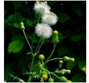
Spiny-leaved Sow Thistle