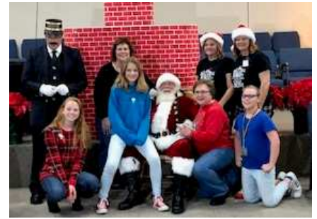
Polar Express was a HUGH success on Friday, November 30.