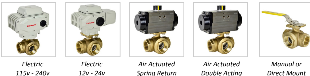
Electric 115v - 240v