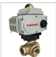
Electric 110vac - 24vdc