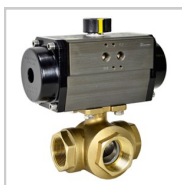
Air Actuated Spring Return