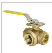
Manual or Direct Mount