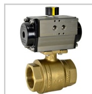
Air Actuated Spring Return