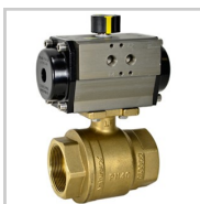
Air Actuated Spring Return