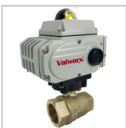
Electric 110vac - 24vdc