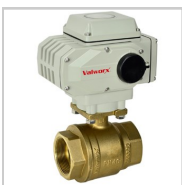
Electric 115v - 240v