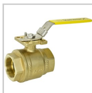
Manual or Direct Mount