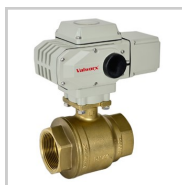
Electric 12v - 24v