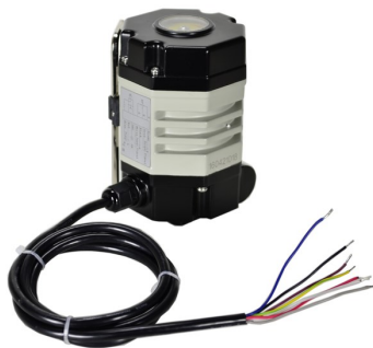
Prewired electrical cable with flying leads