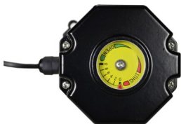
Yellow visual position indicator and cam cover