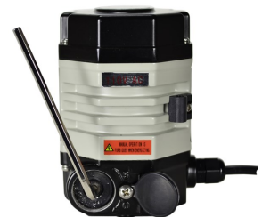
Manual override with hex wrench shown