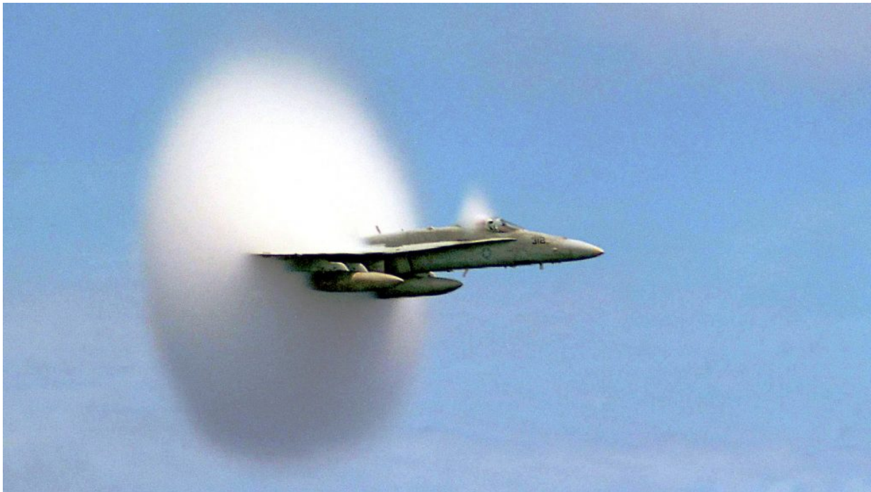
A jet aircraft "breaking the sound barrier" - traveling faster than 343 m/s