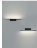
C1 / R1 wall rotating R1 wall