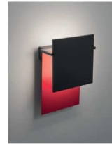
C1 wall rotating scene