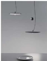
D1 / D2 ceiling D1 / D2 ceiling up&down