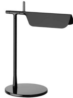
● F6560030 Black