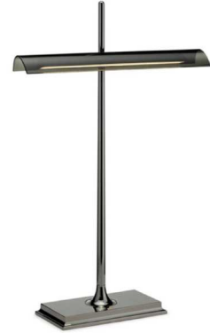
● F3140030 Black