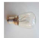
15W E14 Clear Ball Incandescent