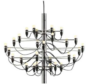
0 AU150057 Chrome

Gino Sarfatti is known for his contribution to the modern architectural movement in lighting. The 2097 modern ceiling light is a great example of his utilitarianism and his overall obsession of creating humble yet incredibly effective pieces of lighting.