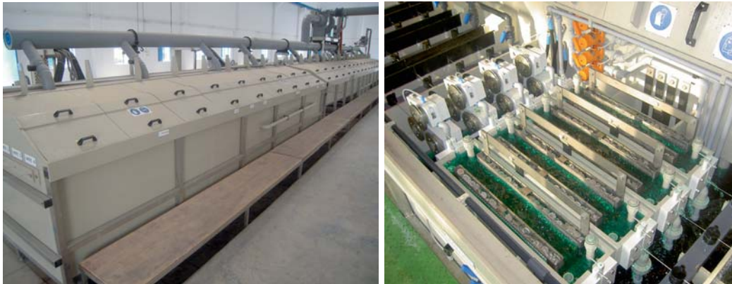
Plant plant for 4 individual wires