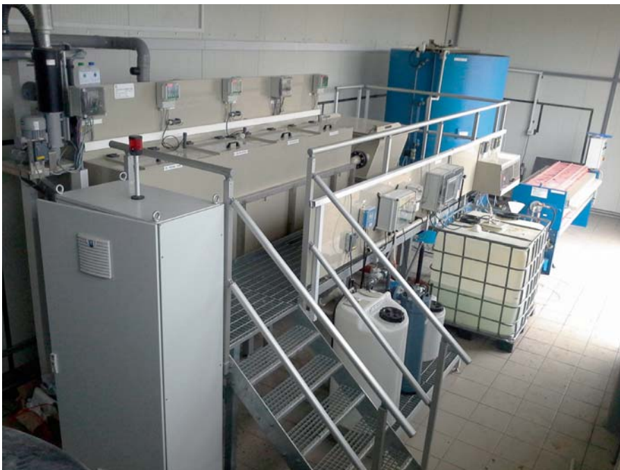
Waste water treatment by neutralization and separation processes.