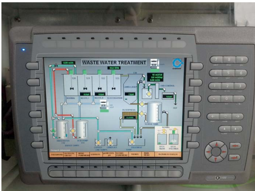
PLC control system