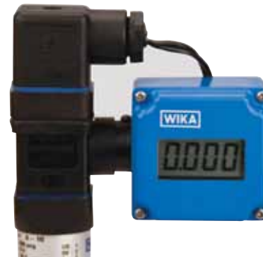
Display installed on Type S-10 or S-11 transmitter

Two user-selectable filtering levels smooth the display during dynamic pressure changes and brief pressure peaks can be suppressed. All programmed parameters are stored in an EEPROM so in the event of a power failure reprogramming is unnecessary.