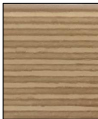
Ply Edge Option

For required finish, please suffix code with MA – Maple, AO – Alchemy Oak, RO – Rye Oak, BE – Beech, WL – Walnut, WH – White, GR – Grey. All Carcasses are 18mm thick with modular tops 25mm thick MFC with square edge. Standard specification will match the edge finish with the top finish. Contrast edge & ply effect edge are available at standard cost.