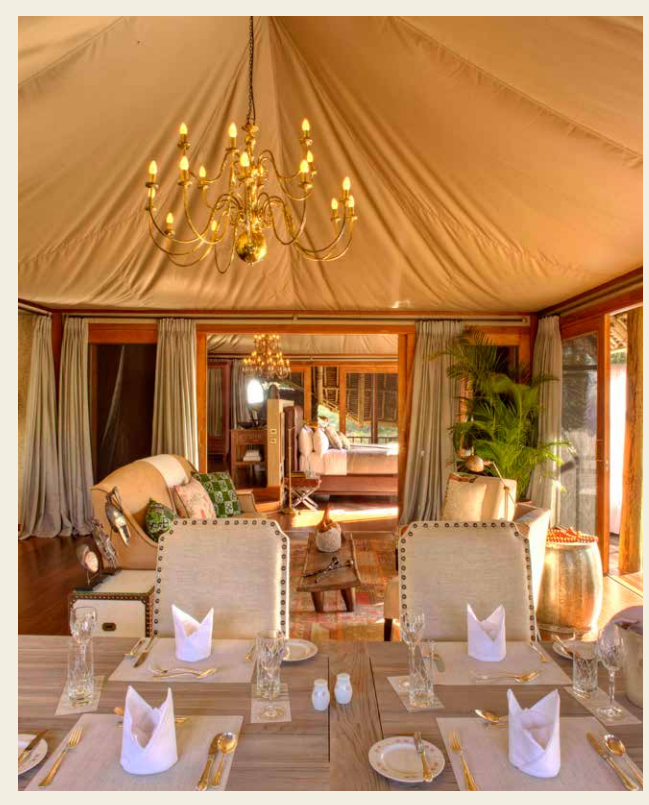
Finch Hattons Luxury Safari Camp

in mixing luxe with earthy enjoyment. Even the setting of the camp is dramatic: the cloud forests of the Chyulu Hills, and beyond, gargantuan Mount Kilimanjaro provide a majestic backdrop, and in the foreground, ever-viewable from our suite's decks, animals congregate at the camp's water hole, and hippos cavort in a couple of their own pools.