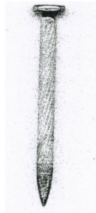
a. Knurled Shank Pin

8 Allowable negative transverse load is for wall assemblies sheathed with gypsum sheathing attached by using knurled-shank power-driven pins on the exterior side of the walls.