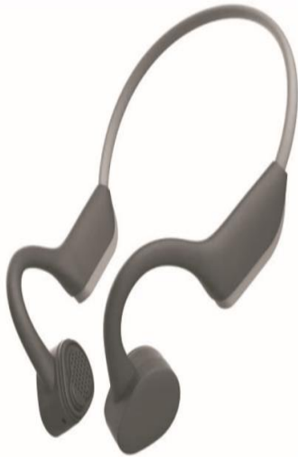
Manual Instruction for Bone Conduction Headphones