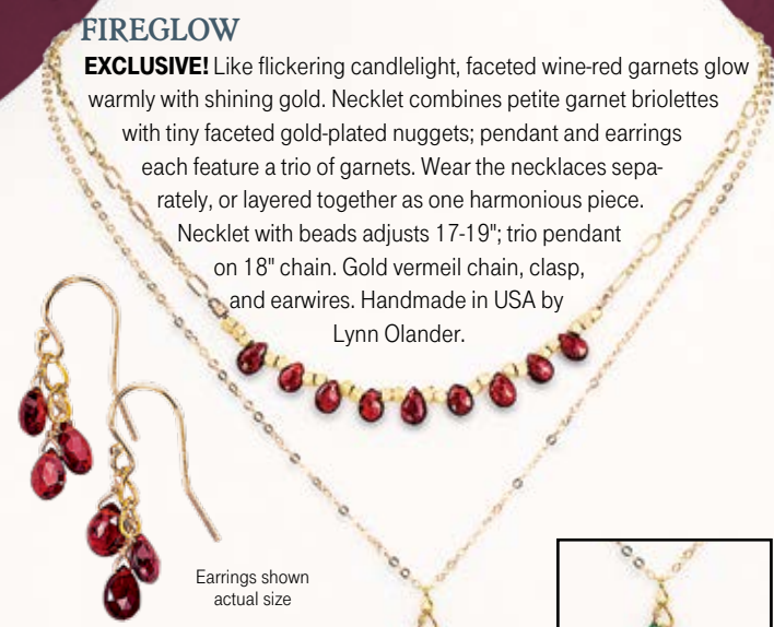
Earrings shown actual size

EXCLUSIVE! Like flickering candlelight, faceted wine-red garnets glow warmly with shining gold. Necklet combines petite garnet briolettes with tiny faceted gold-plated nuggets; pendant and earrings each feature a trio of garnets. Wear the necklaces separately, or layered together as one harmonious piece. Necklet with beads adjusts 17-19"; trio pendant on 18" chain. Gold vermeil chain, clasp, and earwires. Handmade in USA by Lynn Olander.