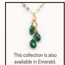
This collection is also available in Emerald.

J10433 Gemstone Trio Earrings $67 J20666 Gemstone Briolette Necklet $110 J20667 Gemstone Trio Pendant $85 SAVE 10% When you buy two or more pieces!