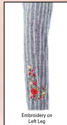
Embroidery on Left Leg