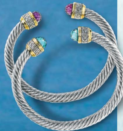
Shown at 3/4 size