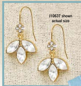
J10637 shown actual size