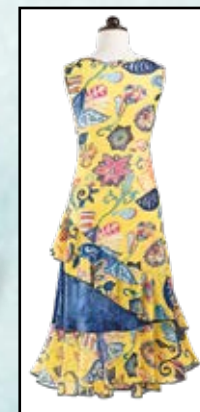
Back of dress