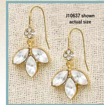
J10637 shown actual size