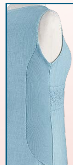
Stretchy ribbed back panel for easy fit