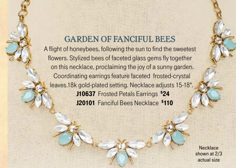
Necklace shown at 2/3 actual size