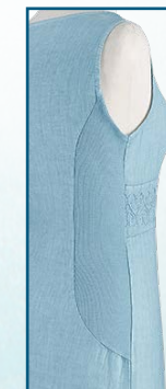
Stretchy back panel for easy fit