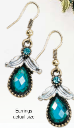
Earrings actual size