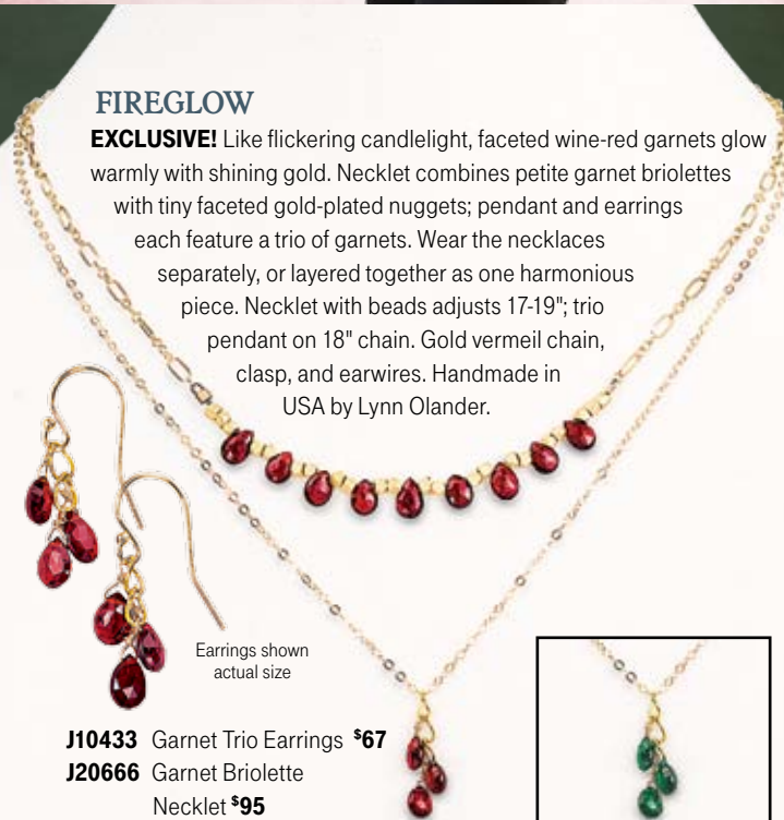
Earrings shown actual size

EXCLUSIVE! Like flickering candlelight, faceted wine-red garnets glow warmly with shining gold. Necklet combines petite garnet briolettes with tiny faceted gold-plated nuggets; pendant and earrings each feature a trio of garnets. Wear the necklaces separately, or layered together as one harmonious piece. Necklet with beads adjusts 17-19"; trio pendant on 18" chain. Gold vermeil chain, clasp, and earwires. Handmade in USA by Lynn Olander.