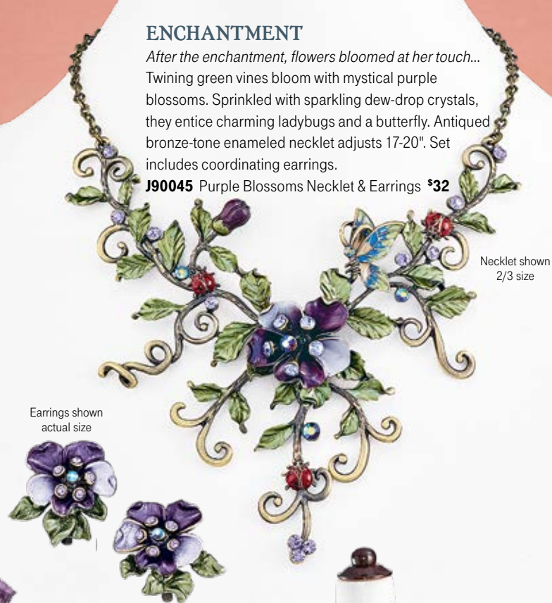
Earrings shown actual size

J90045 Purple Blossoms Necklet & Earrings $32