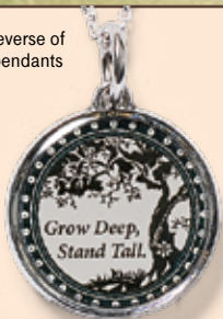
reverse of pendants