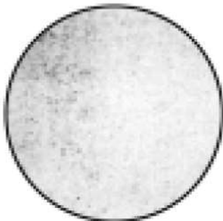
100 (ISO 5)