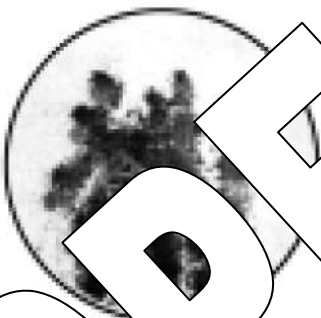
70 (ISO 2)