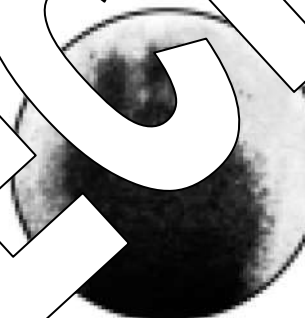
50 (ISO 1)