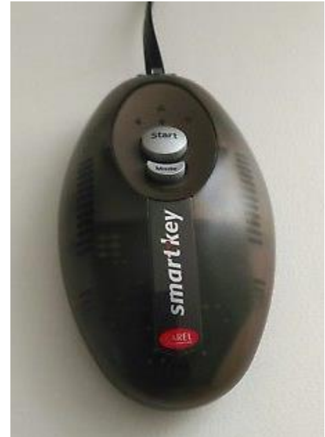
Figure 1: Carel Smart Key