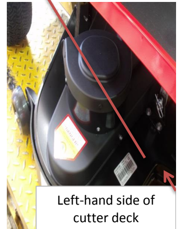
Left-hand side of cutter deck

What does a Countax & Westwood Serial number look like and what does the information mean?