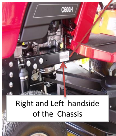
Right and Left handside of the Chassis