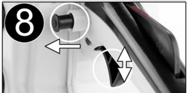
Disengage the throttle-lock by pulling and releasing the throttle trigger

Allow the engine to warm up before use. Disengage the chain break before revving the engine. Ensure all safety precautions are adhered to prior to using your saw.