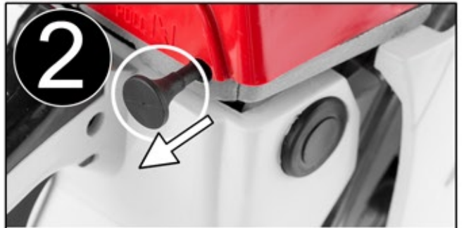
Pull the choke OUT (choke ON)