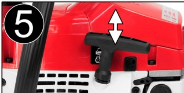
Pull the starter handle several times until the engine is heard to splutter