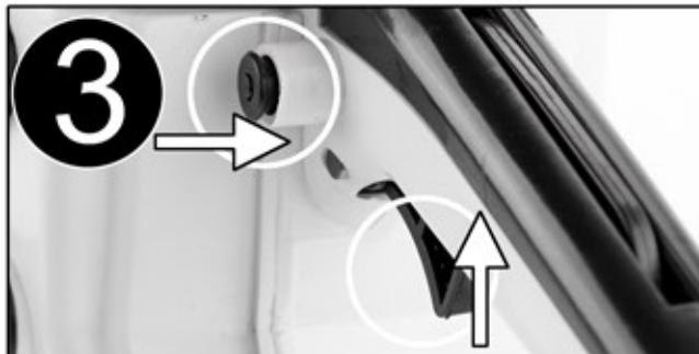
Lock the throttle into the start position using the throttle-lock button