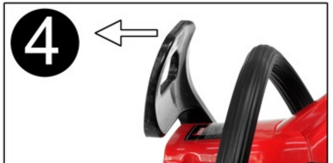
Engage the chain brake by pushing the safety handle forward until it clicks into place