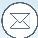
Enterprise Secure Messenger