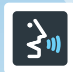
Voice Activated Code