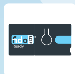
FIDO Security Key