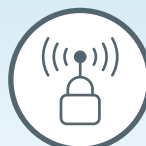
Enterprise Wi-Fi Protection