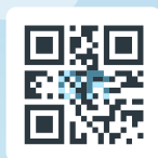
QR Code Access