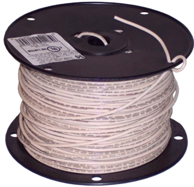
14 AWG stranded wire 19 strands of 27 AWG

An antenna with a narrow field can be made from inexpensive stranded copper wire used in house construction.