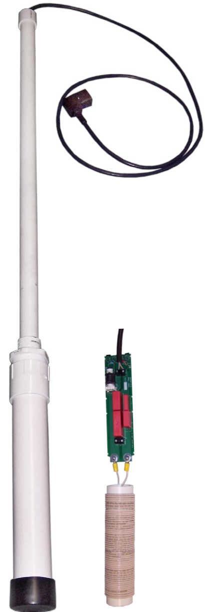
39 turns around 1 1/4" PVC pipe