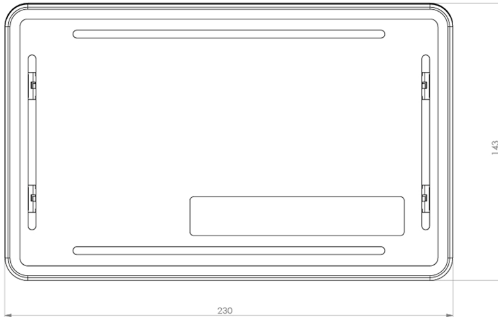
Figure 2 Sketch housing front view

Martin.Care Sicherheitssysteme für das Gesundheitswesen