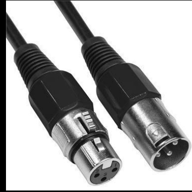
XLR (f - left) to XLR (m - right)

If there are still problems, replace the XLR cables from Spares. You can use either XLR to XLR or XLR to Jack (6m versions)