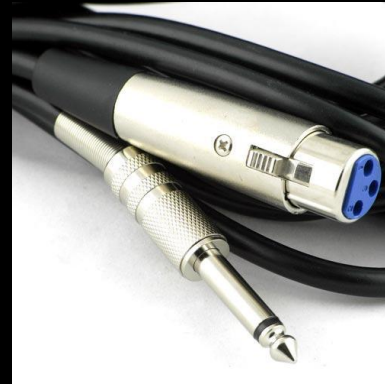
XLR (f) to 1/4 inch jack