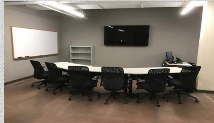
- Training Lab -