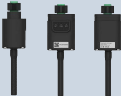
Solis Cellular Data Logger 4G