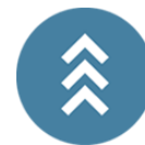
Figure 1. migFx EBS Components