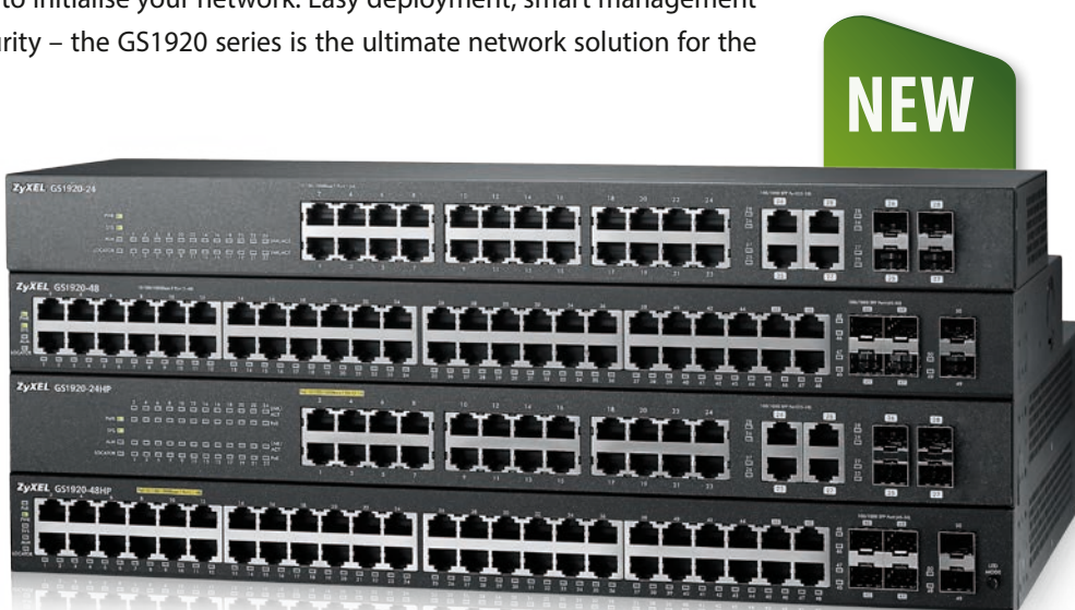
GS1920 Switch-Series 24/48-port GbE Smart Managed Switch