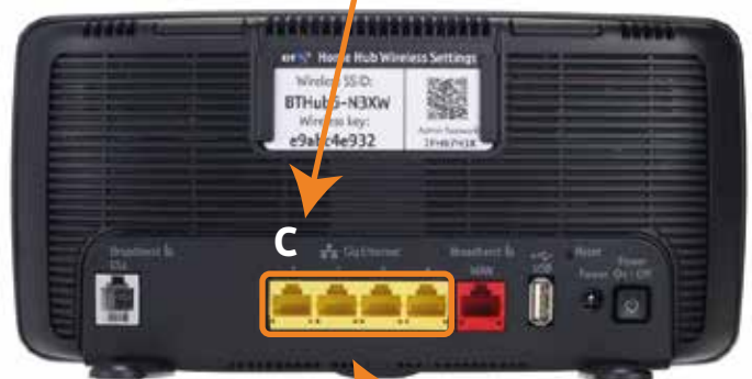
LAN or Ethernet Ports

If you have any issues setting up, please call the SIT Helpdesk on : 0333 200 4330