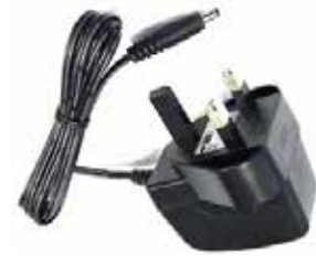
Mains Power Supply