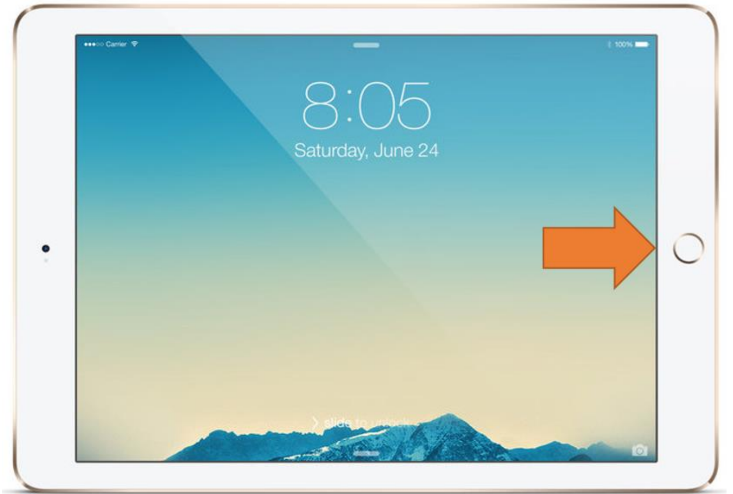
Fig. 1 Above Fig. 2 Below