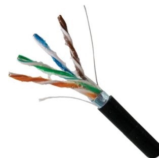
Vertical Cable 059-487/S/CMXF

If you have any questions concerning this TSB contact GRIDSMART at 1-866-652-5347 or Support@GRIDSMART.com .