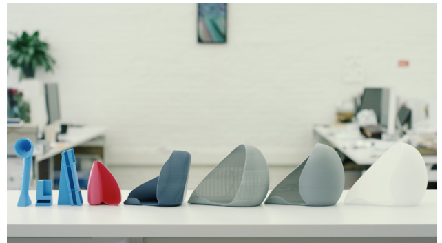
Development processes shrink from months to days

3D printing and access to the global network of users allows Bhold to scale design and testing in a way that isn't possible with any other method. Bhold's collaboration with Ultimaker means anyone around the world with a 3D printer can download a digital file, print the design on their printer and send in feedback immediately. This eliminates problems with shipping, damage from transport and handling and delays in international shipping. Each product gathers the maximum amount of testing data and is shaped with real-world feedback. Bhold and users can see how concepts evolve over time.