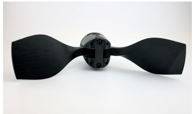
Using the Ultimaker, Sylatech saw an acceleration in the placement of tooling orders from its clients. They managed to earn back the investment in their Ultimaker machine within 3 months.