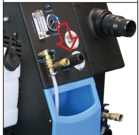
Location of pressure regulator (unloader) on Escape™ ETM.