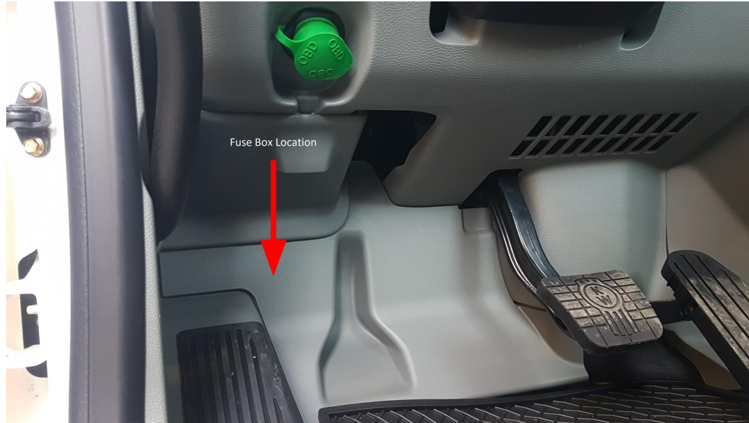
Figure 1.0 - Fuse Box Location