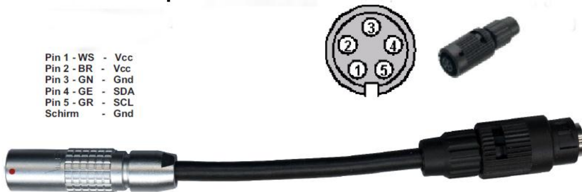
Figure 2 LEMO female connector - Binder male connector adapter pinning