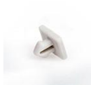
TEKNIK Clip (24003)