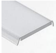
cover type HS22 frosted (17011) clear (17022)