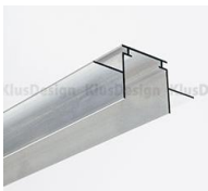
extrusion TEKNIK (B5555)