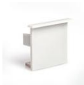
end cap LOKOM without hole (24005)