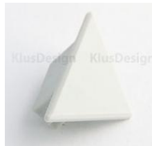
end cap without hole (00084)