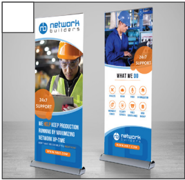
Trade Show Booth Decor