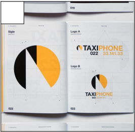
Brand Style Guide

With the help of these tools, you can easily create, manage, and organize your campaigns. These tools are designed to lighten your team's workload with the use of tools that are one click away.