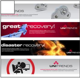
Web Banner Ads