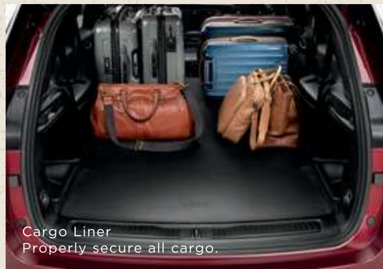
Cargo Liner Properly secure all cargo.