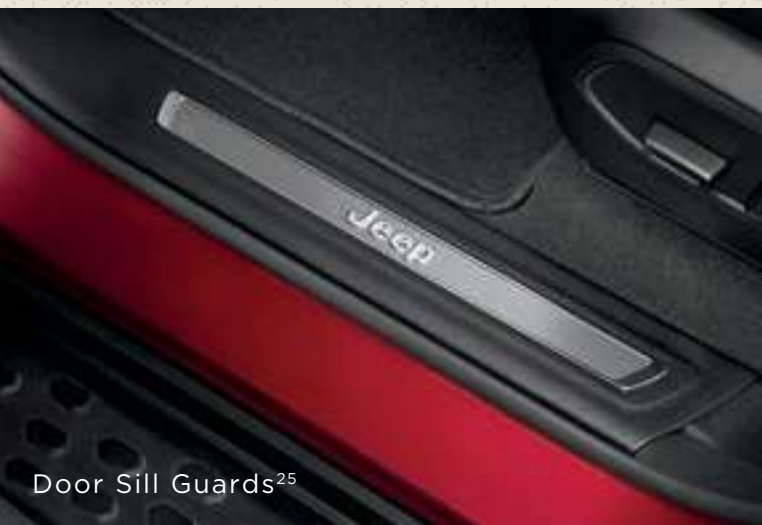
Door Sill Guards 25

Jeep ® Grand Cherokee L Laredo in Velvet Red Pearl features Black Side Steps, Black License Plate Frame, 21-inch Mopar ® Unique Wheels, Mopar Center Caps, Front and Rear Splash Guards, Roof Rack Crossbars, Cargo Box Carrier, 24 Hitch Receiver, Hitch Ball-Mount Adapter and Hitch Ball