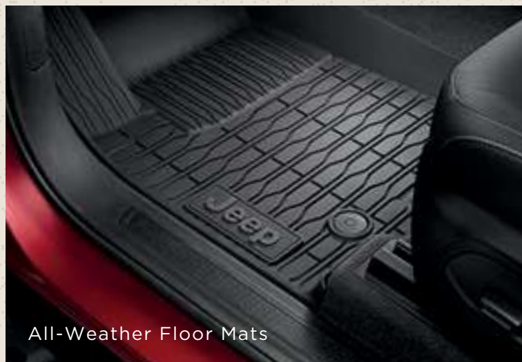
All-Weather Floor Mats