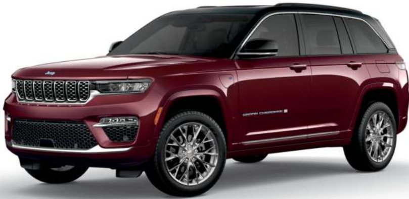
Summit® 4xe in Velvet Red Pearl