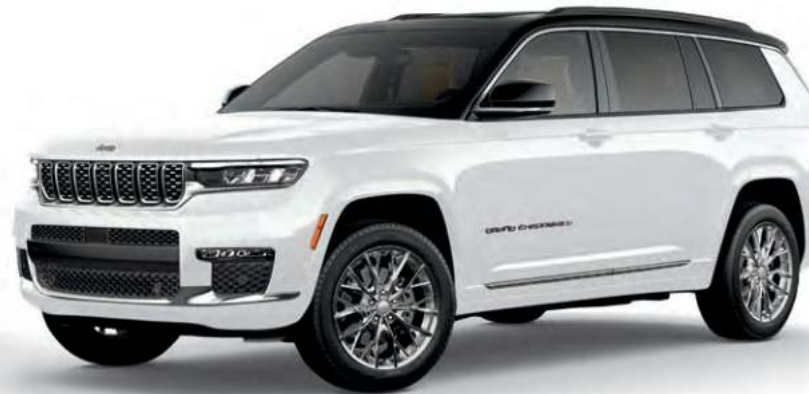
3-Row Summit in Bright White