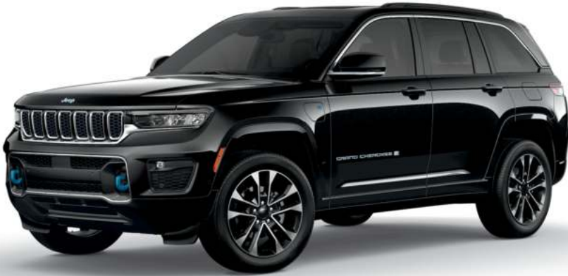
Overland® 4xe in Diamond Black Crystal Pearl