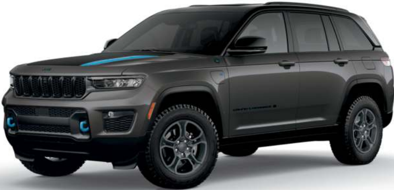
Trailhawk® 4xe in Baltic Gray Metallic