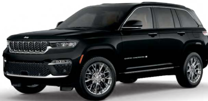
Summit® in Diamond Black Crystal Pearl