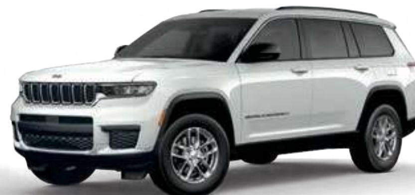
3-Row Laredo in Bright White