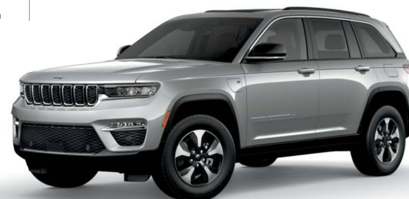
4xe in Silver Zynith