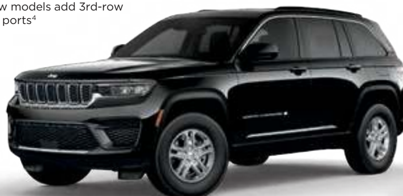
Laredo in Diamond Black Crystal Pearl