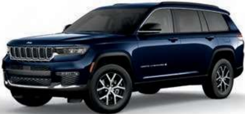
3-Row Limited in Midnight Sky