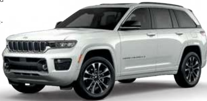
Overland® in Bright White