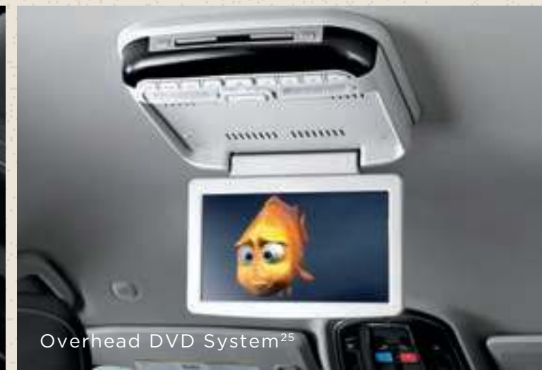
Overhead DVD System 25