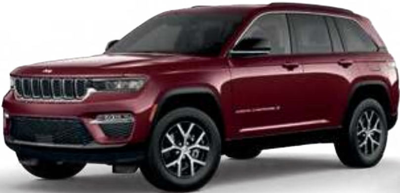
Limited in Velvet Red Pearl