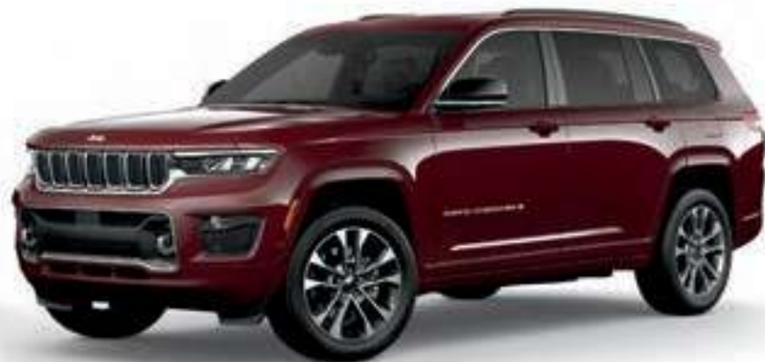
3-Row Overland in Velvet Red Pearl