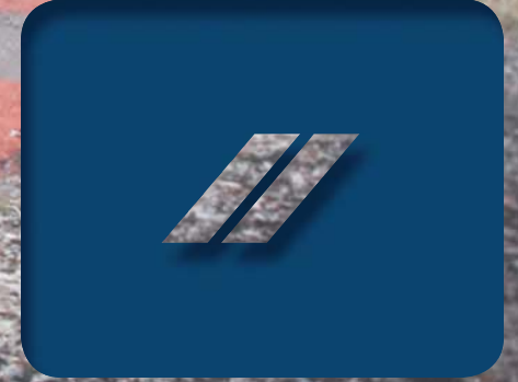
BLUE STREAK PEARL