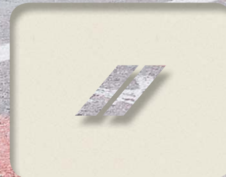
PEARL WHITE TRI-COAT