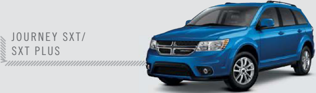
JOURNEY SXT/ SXT PLUS