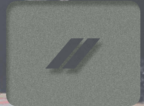
BILLET SILVER METALLIC