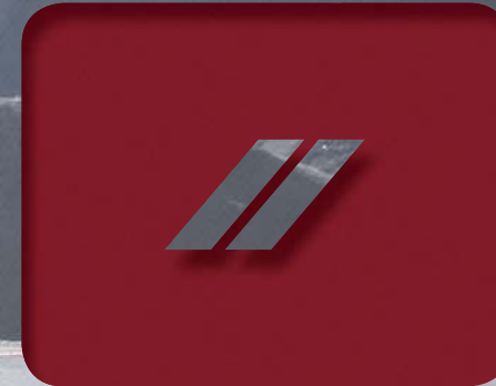
REDLINE RED 2 COAT PEARL