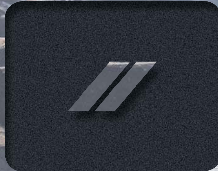
GRANITE CRYSTAL METALLIC